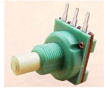
ALPHASTAT 16 PC16ECO

Ausführung / construction: ISO Welle / shaft: \varnothing 4 mm, L = 30 mm \varnothing 6 mm, L = 35 mm Buchse / bushing: M10 x 0,75 Drehbereich / rotation angle: 300° Printausführung / for printed circuits (PC) Conductive Plastic